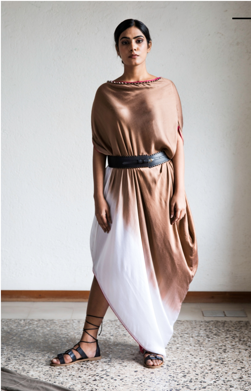
Cotton sateen Ombre cowl dress with boat neck and metallic detail. Ew-85