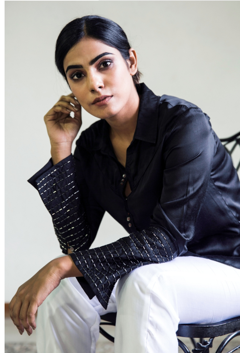
Cotton sateen Shirt with ,metallic detailing on long cuffs. Ew-105