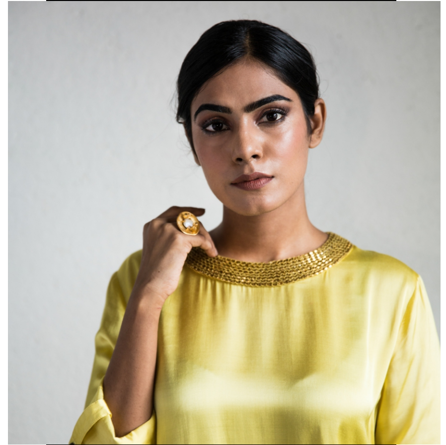
Cotton sateen Long straight tunic with metal mesh detailing on neck. Ew-82